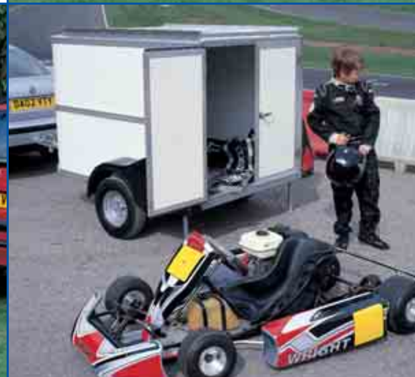
BV64e Roller shutter version