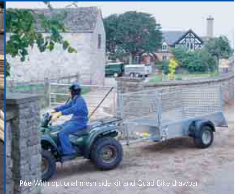
P6e With optional mesh side kit and Quad Bike drawbar