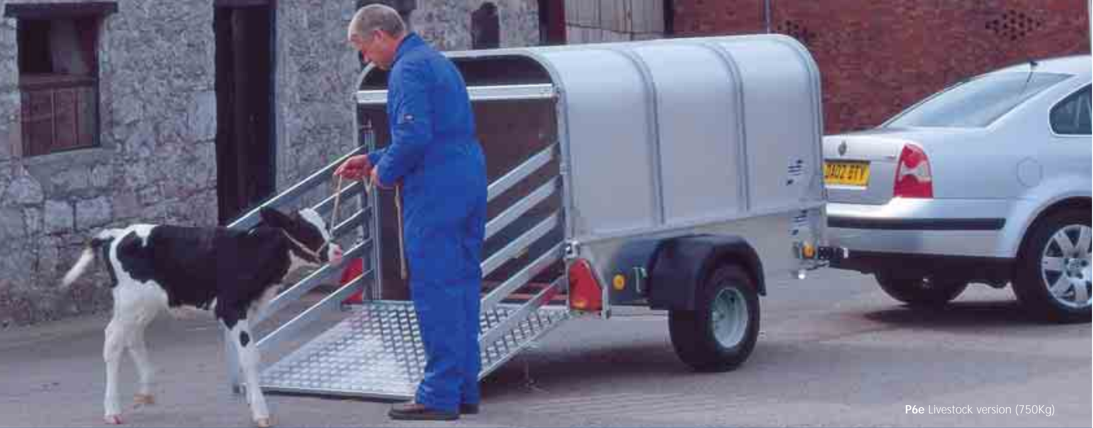
P6e Livestock version (750Kg)