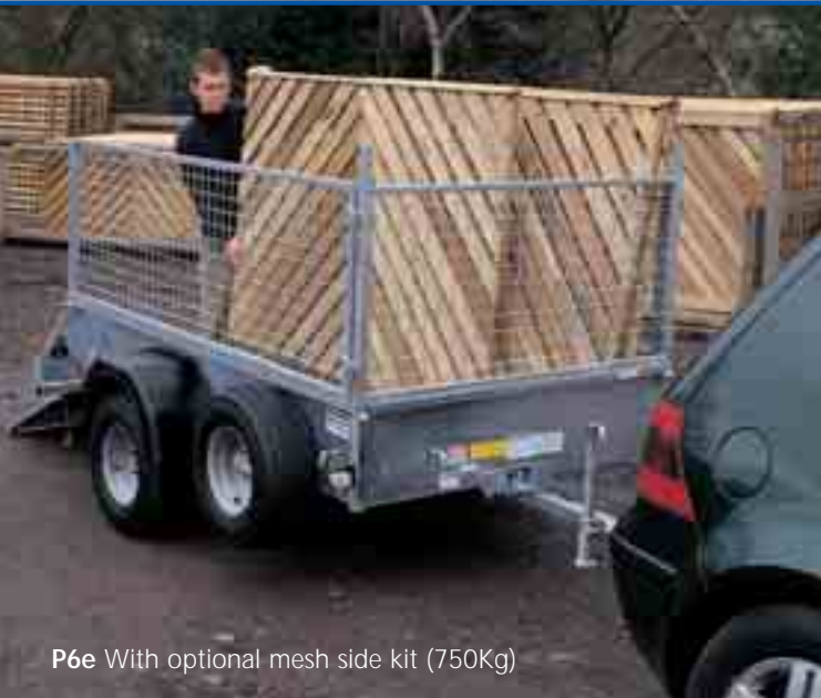
P6e With optional mesh side kit (750Kg)