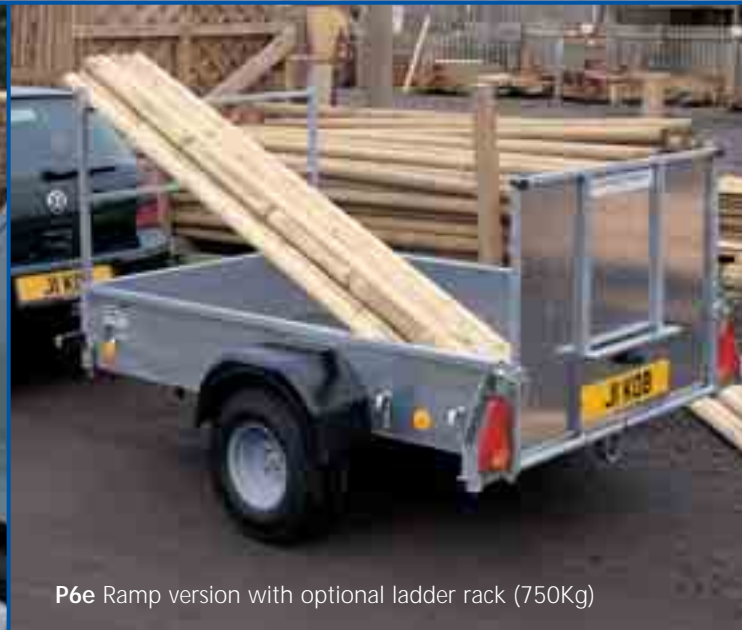
P6e Ramp version with optional ladder rack (750Kg)